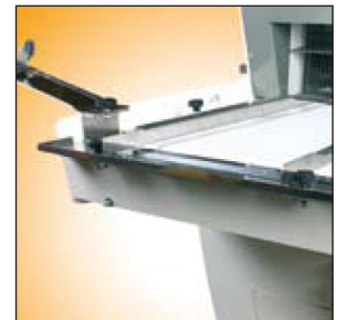
Replace the delivery table and air-blown bagging system with an optional 23.6 inch discharge belt