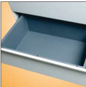
Easy to access drawer containing two durable, 8.72 gallon bins for crumb collection.