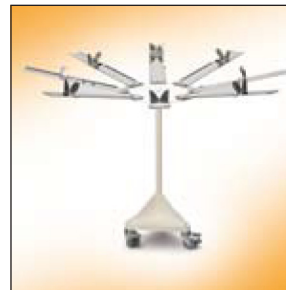
This ingenious rotating bagging spade system will allow you to pack several loaves quickly.