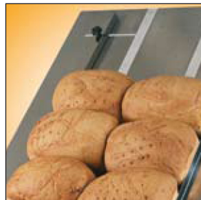
High-capacity ramp featuring side guides and shoes. Used to store and deliver loaves to the slicer.