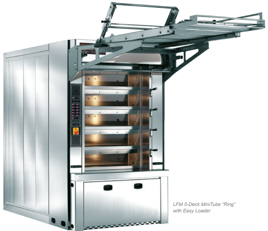
LFM 5-Deck MiniTube "Ring" with Easy Loader