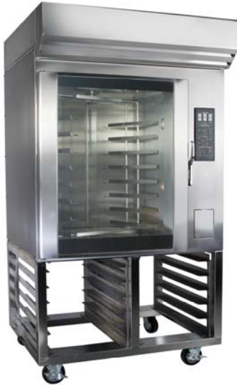
Model LMO-E8S Shown