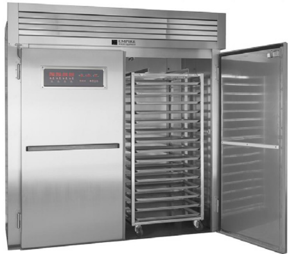
Model LRP2S-40 Shown (rack not included)