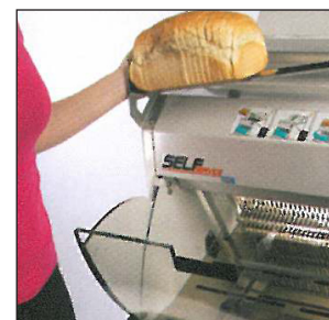
6. Pack the bread using the bagging spade.