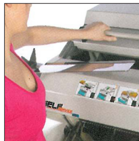
3. Close the cover, slicing will start automatically.