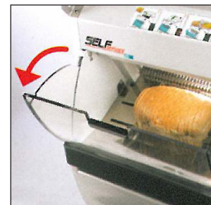
4. Flap opens to indicate slicing is complete.