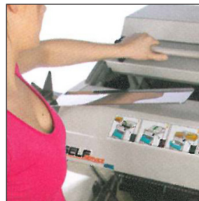
1. Open the cover