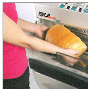
5. Remove the bread, the flap closes automatically.