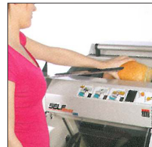
2. Load bread.