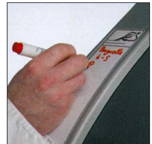
Write down your per bread settings on the laminated memo board.