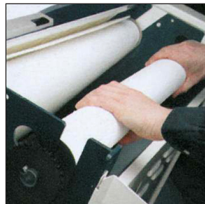
Easily remove belts for worry-free cleaning and maintenance.