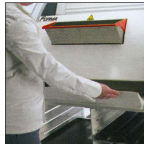
Tuck away the foldaway delivery tray completely to facilitate storage.