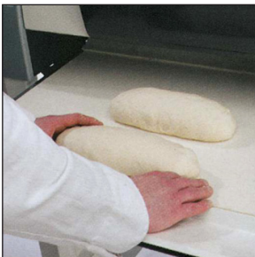
Mould breads from 2-42 ounces, including baguettes up to 27.6" wide.