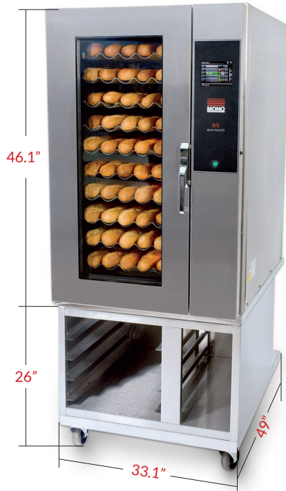
Model EMP-BX10T-ECO w/ optional stand