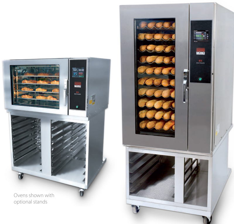
Ovens shown with optional stands