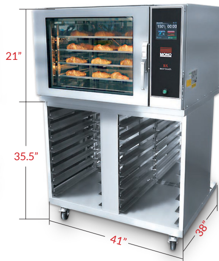
Model EMP-BX5T-ECO w/ optional stand