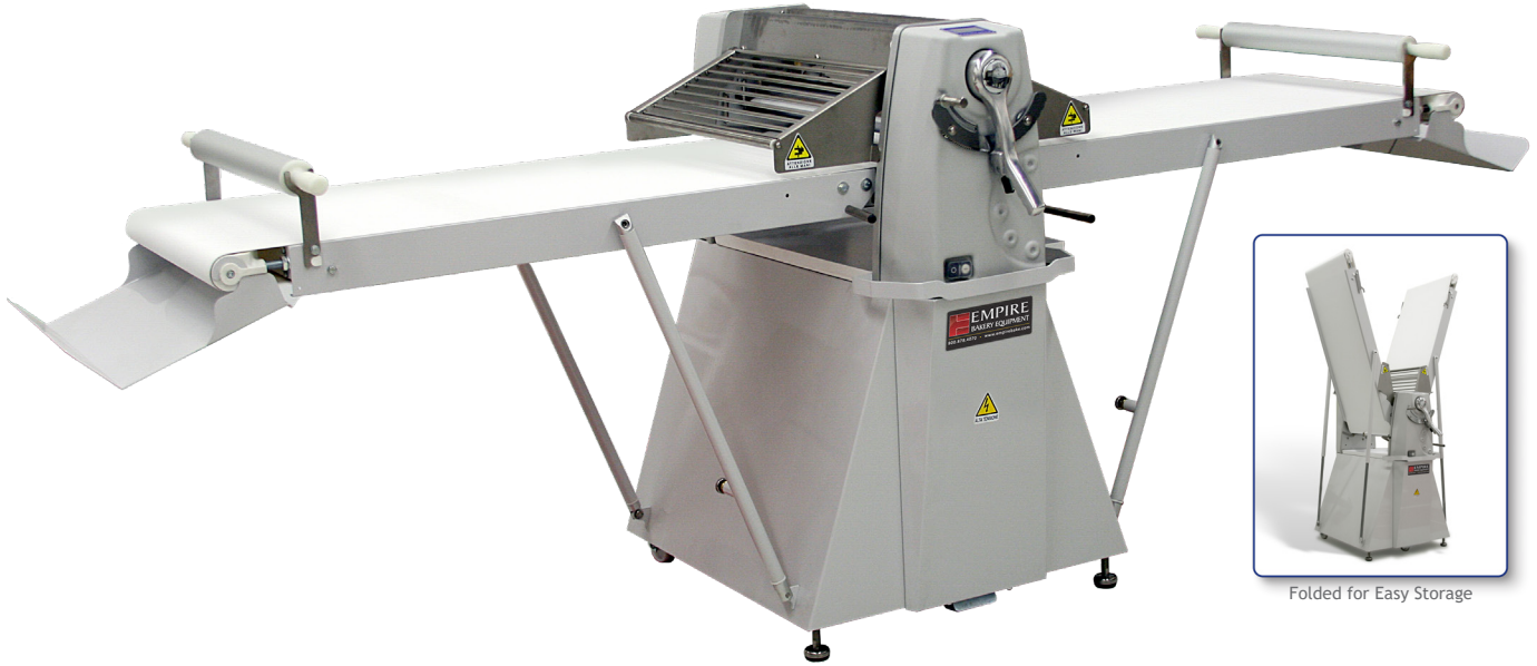
Folded for Easy Storage