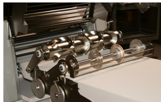
Optional cutting system.