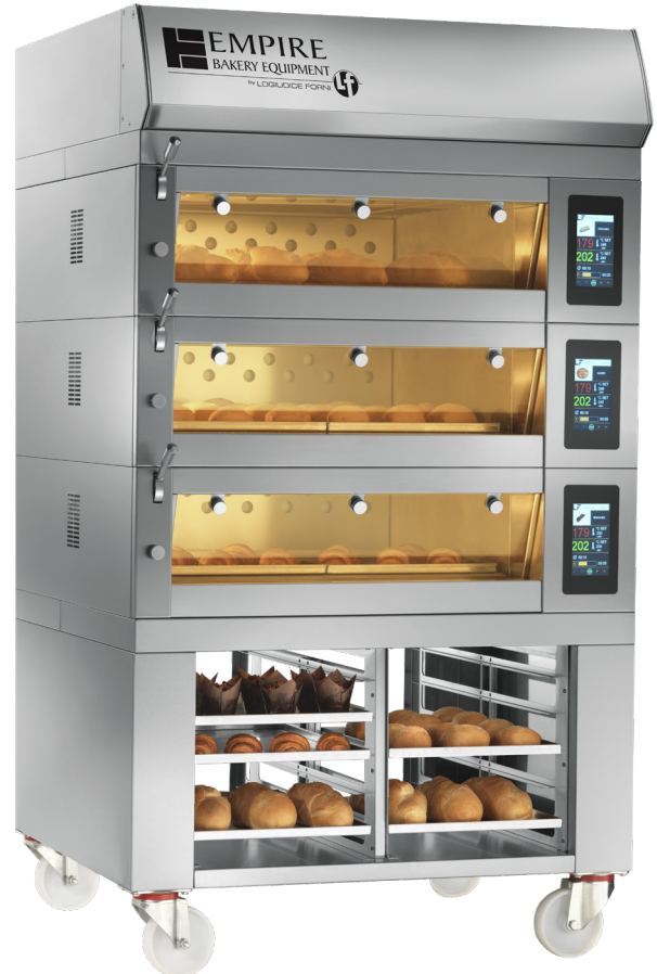
Model LFM-D-2T-3 with optional Hood & Touch Screen Control Panel