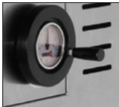
Manual Weight Adjustment Wheel