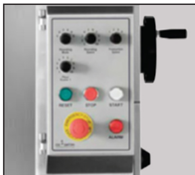
Mechanical Controls with 6 Rounding Programs