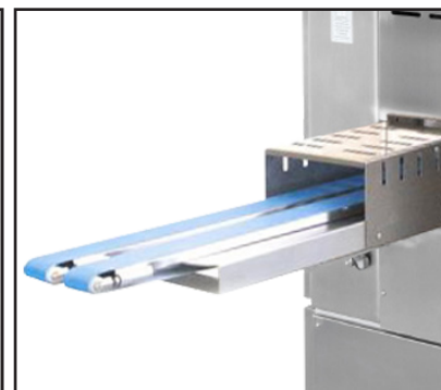
Split Outfeed Conveyor