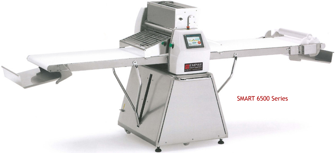
SMART 6500 Series