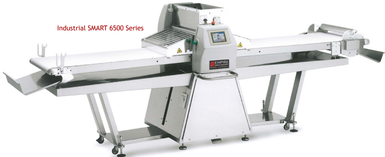
Industrial SMART 6500 Series